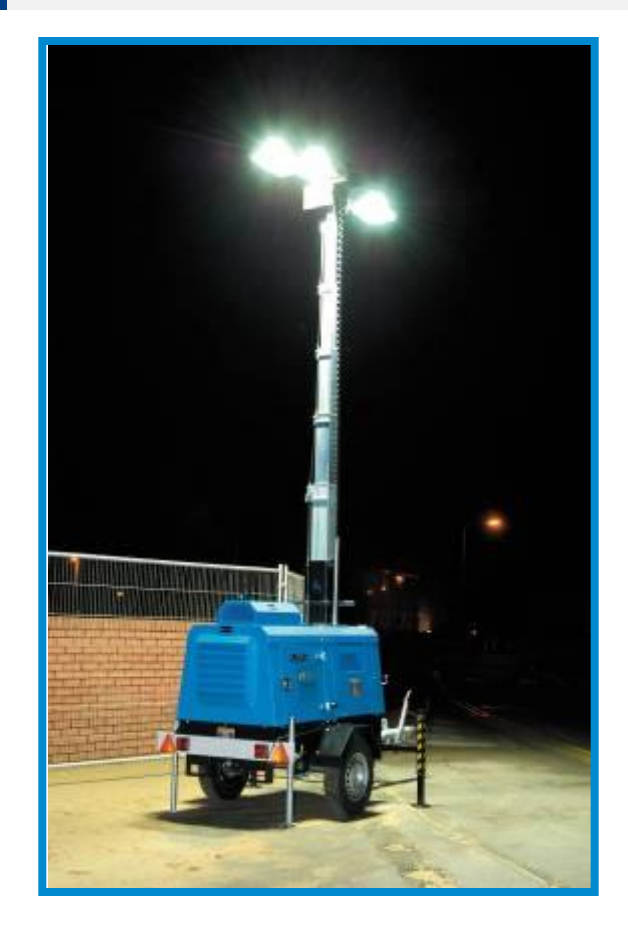
VT1 Lighting Towers