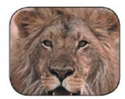
Industry's no 1.