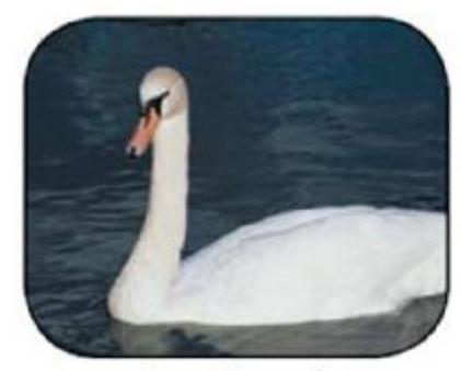
calm on the surface...