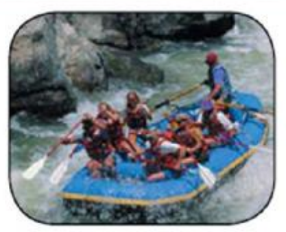
strong team but lacks control